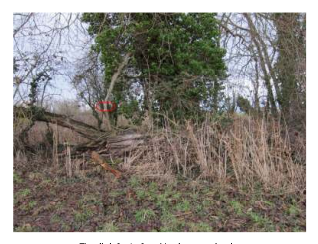
The telltale Logica L marking the treasure location