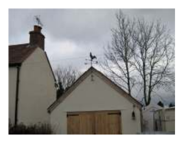
The Cock (some of you noted the wrong vane)