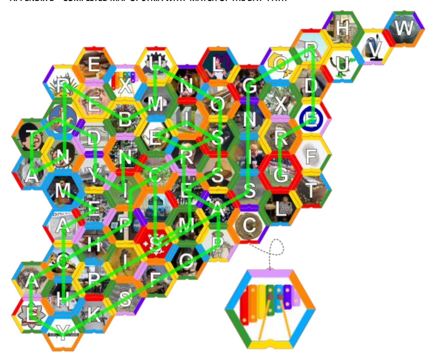
APPENDIX B – COMPLETED MAP OF SYRIA WITH 'MATCH OF THE DAY' PATH